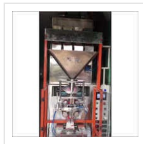
NAMKEEN PACKING MACHINE