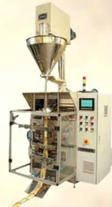
MULTI TRACK-600 LIQUID MACHINES

Automatic Spice Packaging Machine, Bag Filling Machine, Bucket Elevator conveyor, COFFEE POWDER PACKING MACHINE IN STICK, Continuous Band Sealer, Conveyor Belt, Dip Tea Bag Packing Machines, FACE MASK PACKING MACHINE, Garam Masala Pouch Packing Machine, Haldi Packing Machine, Honey Packing Machine, Kurkure Packing Machine, MEHANDI PACKING MACHINE, MULTI TRACK MACHINE IN AUGER, MULTI TRACK MACHINE IN CONDITIONER, etc.