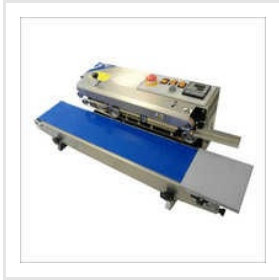
Continuous Band Sealer