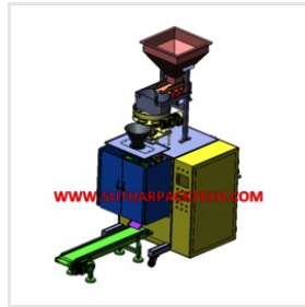
Kurkure Packing Machine