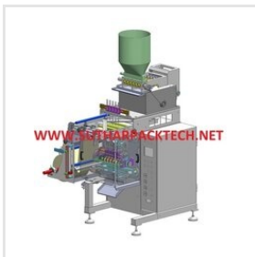
MULTI TRACK MACHINE IN FACE CREAM