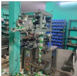
GARAM MASALA POUCH PACKING MACHINE

Automatic Spice Packaging Machine, Bag Filling Machine, Bucket Elevator conveyor, COFFEE POWDER PACKING MACHINE IN STICK, Continuous Band Sealer, Conveyor Belt, Dip Tea Bag Packing Machines, FACE MASK PACKING MACHINE, Garam Masala Pouch Packing Machine, Haldi Packing Machine, Honey Packing Machine, Kurkure Packing Machine, MEHANDI PACKING MACHINE, MULTI TRACK MACHINE IN AUGER, MULTI TRACK MACHINE IN CONDITIONER, etc.