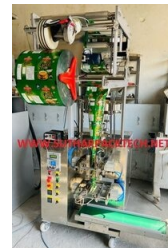
TEA PACKING MACHINE