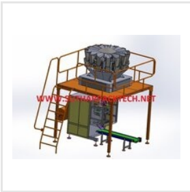
Multi Head Packaging Machines