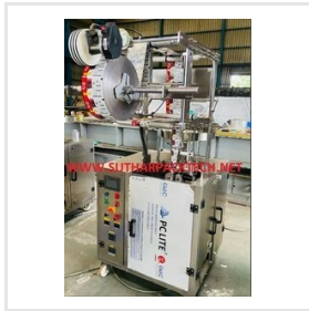
Masala Packing Machine