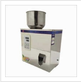
Semi Automatic Weighing Machine