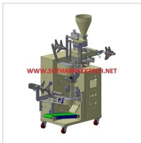
Dip Tea Bag Packing Machines