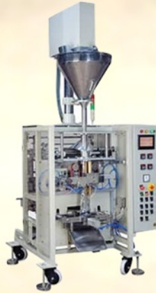
COLLAR TYPE AUGER FILLING MACHINE