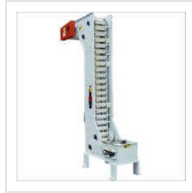
Bucket Elevator Conveyor