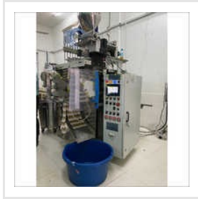
MULTI TRACK MACHINE IN LIQUID FOR