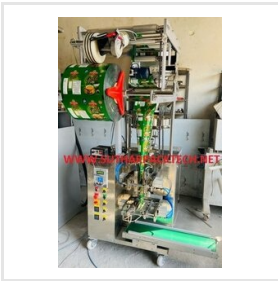
FACE MASK PACKING MACHINE