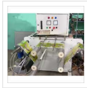
Winder Rewinder Machine