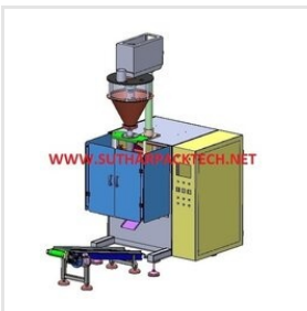
SATTU POUCH PACKING MACHINE